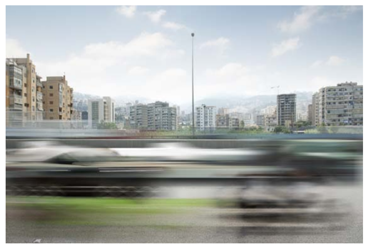
Joana Hadjithomas & Khalil Joreige / Restaged, 2012, C print, Size in 100 x 72 cm / Image: Courtesy of The Third Line and The Artist

Restaged , a photographic series documents the reenactment of the rocket's transportation through the streets of Beirut, capturing traces of strange occurrences throughout.