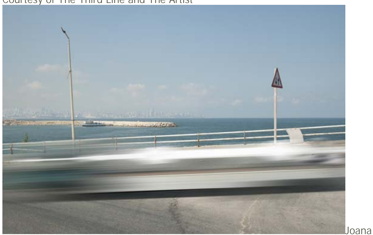
Hadjithomas & Khalil Joreige / Restaged, 2012, C print, Size in 100 x 72 cm