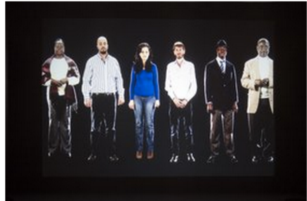
Joana Hadjithomas and Khalil Joreige, A Letter Can Always Reach its Destination , 2012, video installation, video still.

Joana Hadjithomas and Khalil Joreige collaborate as filmmakers and artists, producing cinematic and visual artworks that intertwine. They have directed documentaries such as Khiam 2000-2007 (2008) and El Film el Mafkoud (The Lost Film, 2003), and feature films including Al Bayt el Zaher (The Pink House, 1999) and A Perfect Day (2005). Their last feature film Je veux voir (I want to see), starring Catherine Deneuve and Rabih Mroué, premiered at the Cannes Film festival in 2008 and was selected as the Best Singular Film of the year by the French critics. Their films have been enthusiastically received, won many awards in international festivals and released in several countries. Together, they have created numerous photographic